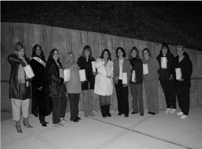
Mayor Mironov participates in the Womanspace 2008 Community of Lights program with current and former Township employees and residents of East Windsor Township.

In the early evening hours of December 14, Mayor Janice S. Mironov, Council Members, Township staff, Domestic Violence Victim Response Team Members and local residents assembled to participate in Womanspace sponsored 2008 "Communities of Light" program, lighting up the Township's Municipal Building with luminary kits purchased with private donations.