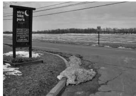
Future site for new playing fields is located across from Etra Lake Park.

The design has been completed for the new playing fields on Disbrow Hill Road, directly across from Etra Lake Park, and the project has gone out to bid. The recreational fields will consist of two softball fields, compatible for use by both adult and youth leagues with adjustable baseline dimensions and two multipurpose soccer/lacrosse fields. The site will include parking, necessary drainage/detention basin, and a new well/water treatment system for irrigation for the fields. The new facility will be located on part of 59 acres of open space acquired by the Township with Green Acres grant funds. Mayor Mironov and Council Members obtained $1.2 million in county and state grants to support the project, geared to expanding playing facilities for our children and local sports organizations.